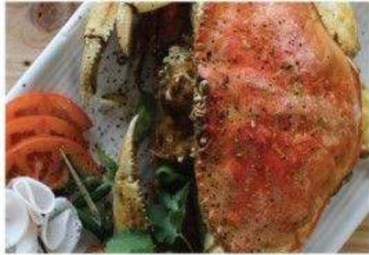
Salt and Pepper Dungeness Crab