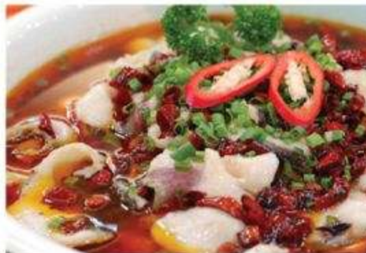
SiChuan Boiled Fish