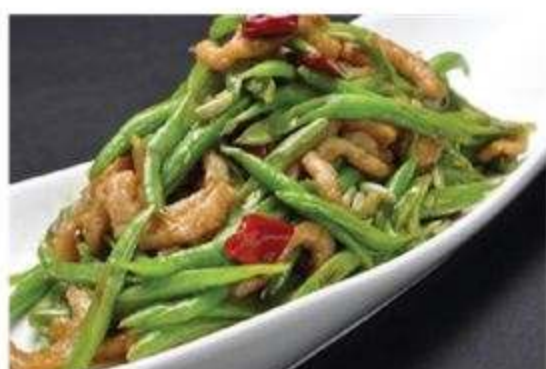
String Bean w/ Pork