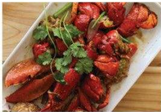
Ginger Scallion Lobster