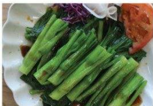
Yu Choy w/ Oyster Sauce