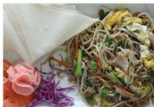
Home style Pork Belly w/ Bean Sprout Spring Roll