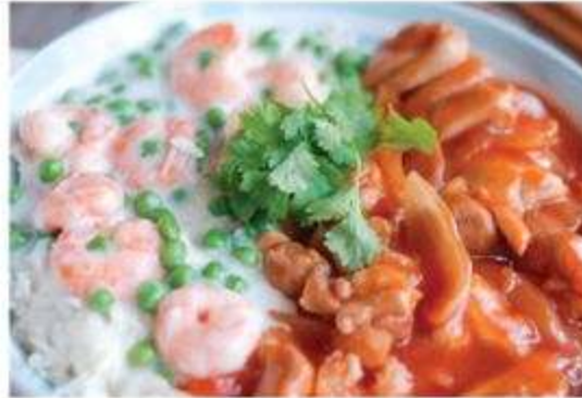
Yuan Yang Fried Rice