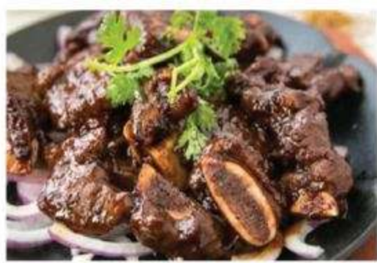
Beef Short Ribs w/ Black Pepper Sauce