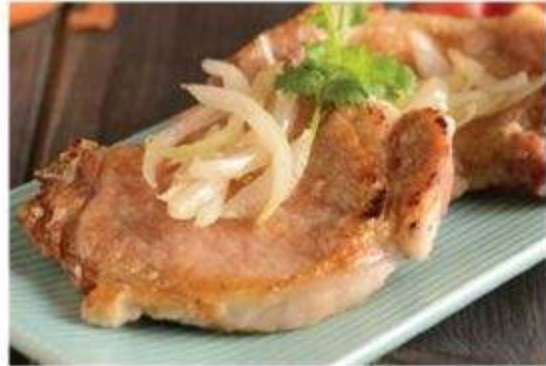
Spicy Salted Pork Chop w/ Onions