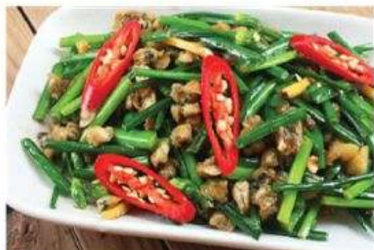
Preserved Meats w/ Chives