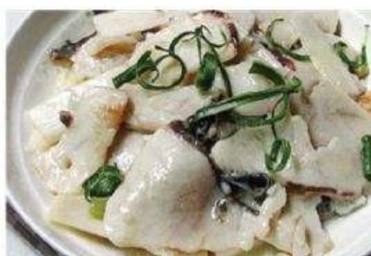
King Oyster w/ Swai Fillet