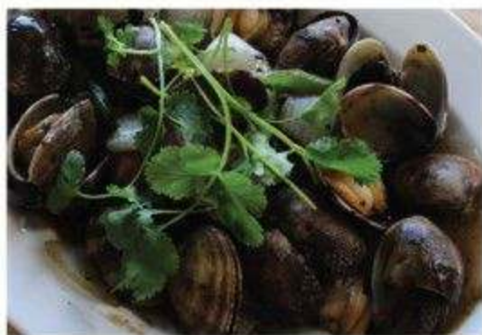
Black Bean Sauce Clam