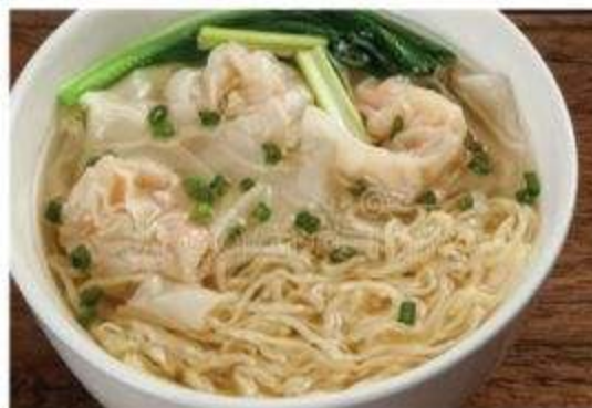
Shrimp w/ Wonton Noodle Soup