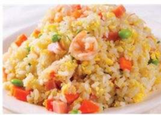
Yang Chow Fried Rice