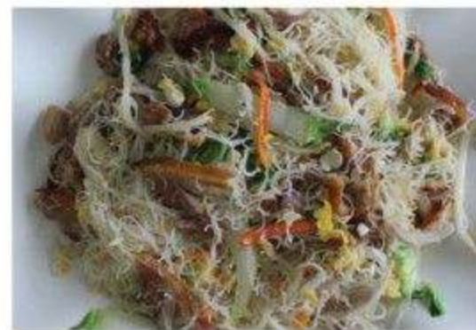
Shredded Duck Mei-Fun