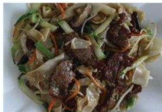
Beef Chow Fun