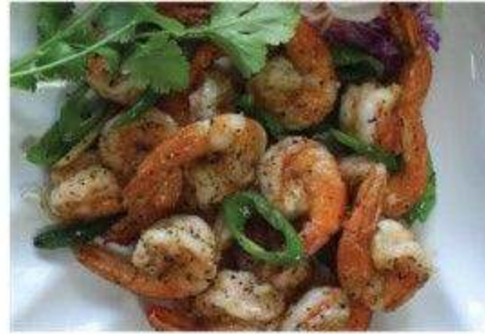
Salt and Pepper Shrimp