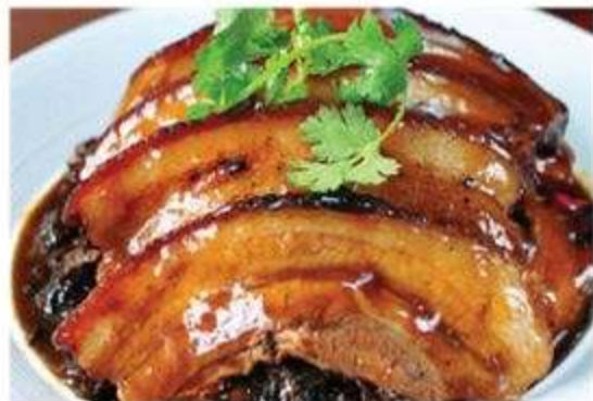
Roast Pork w/ Preserved Vegeta- bles