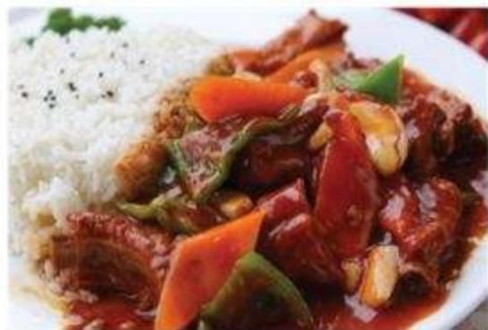
Spare Ribs w/ Vegetables