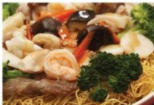
Hong Kong Style Seafood Chow Mein