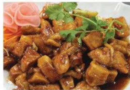
Swai Fillet w/ Potato