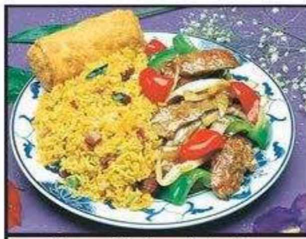
Pepper Steak w. Onion Co.