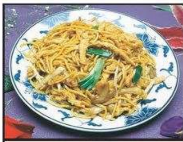
Special Lo Mein