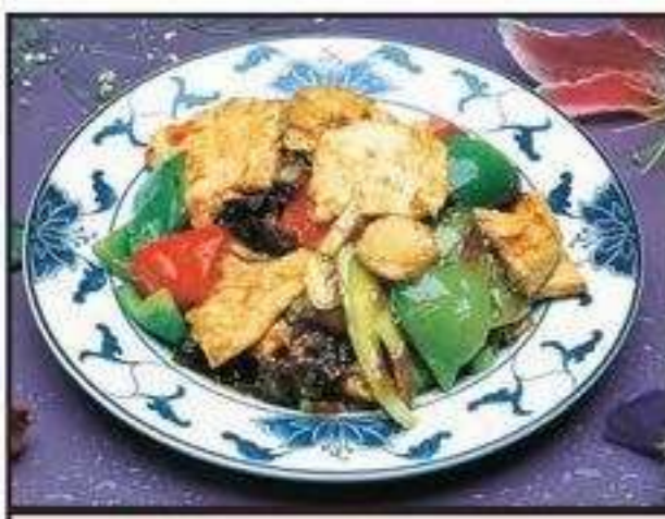
★ Chicken w. Garlic Sauce