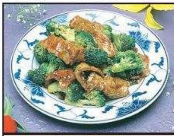
Beef w. Broccoli