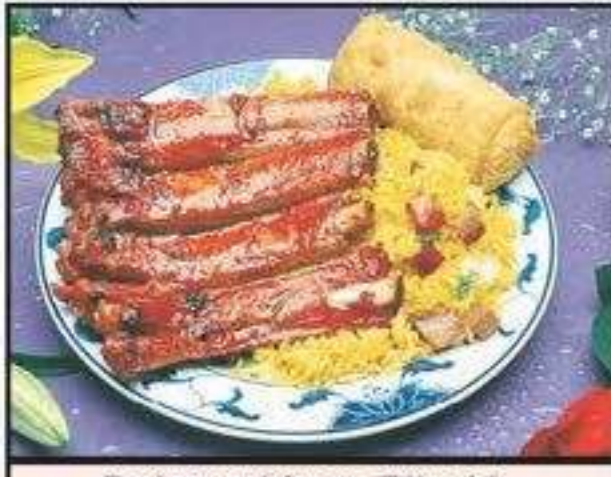
Barbecued Spare Ribs CO.