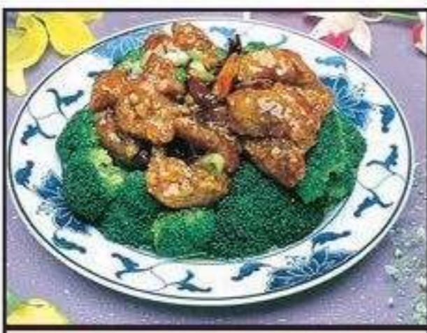
★ General Tso's Chicken