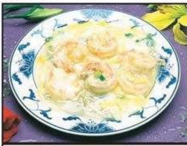
Shrimp w. Lobster Sauce