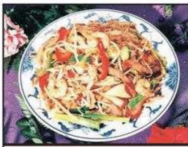
★ Singapore Rice Noodle