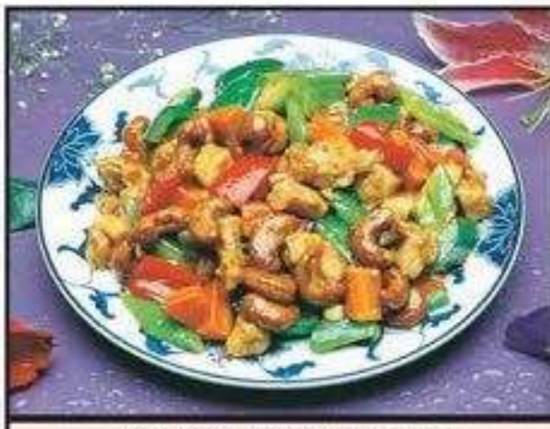
Chicken w. Cashew Nuts