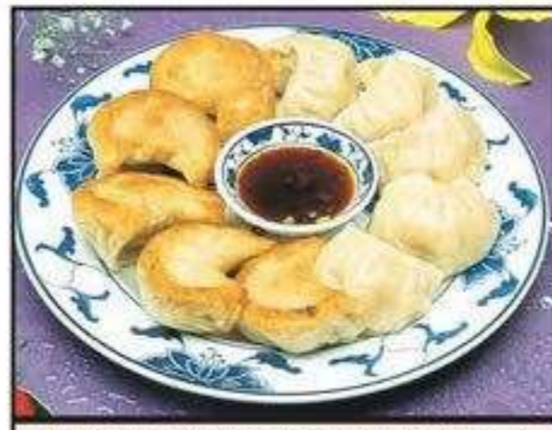
Fried or Steamed Dumplings (10)