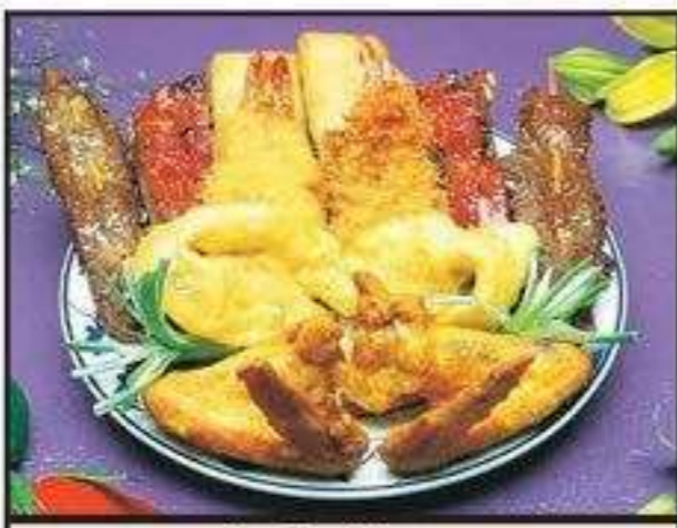
Bo Bo Platter