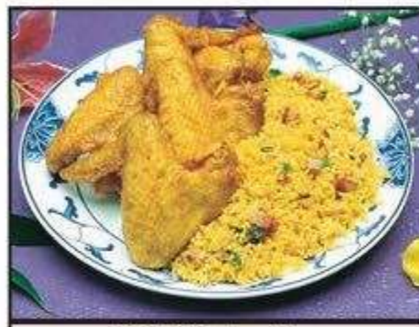
Fried Chicken Wing